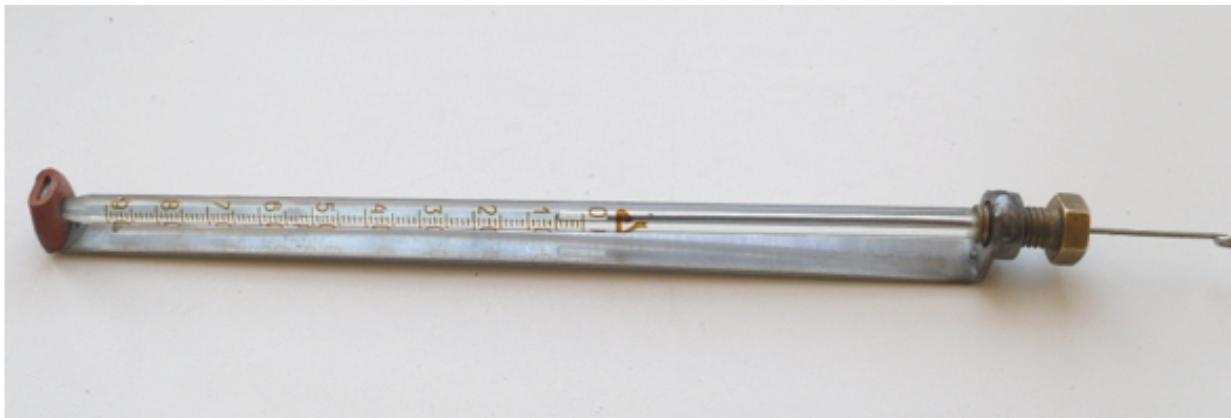
Figure 2: The holder with a capillary.

The data obtained in both sets of experiments: seed germination and water fractions assessment underwent computer processing using Student's t-test with a statistically significant difference of p < 0.05 .